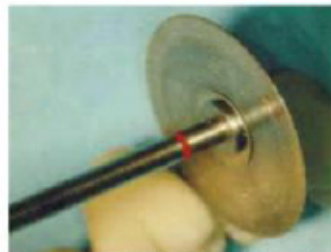
Cerakill, highest quality disc

Para un proceso de trabajo donde se requiere mayor flexibilidad, se utiliza un disco estándar de flexicut y simplecut.